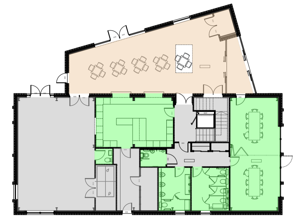
Proposed Ground Floor Key Plan 1:200