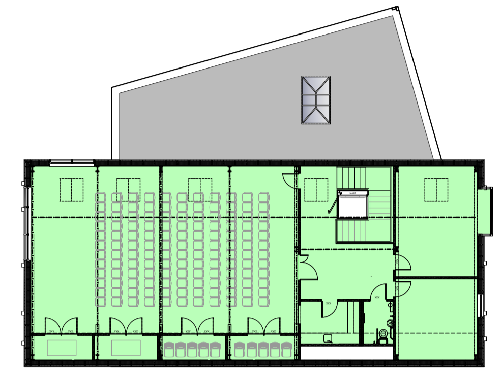
Proposed Ground Floor Key Plan 1:200